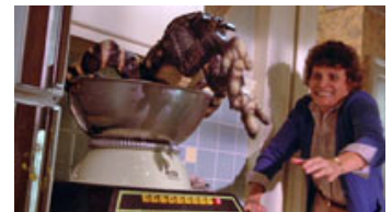
Fig. 7. Gremlin purée.