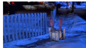
Fig. 11. Slippers in the snow.