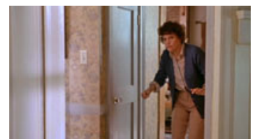
Fig. 4. Gremlin revealed, Stage 1.

The creatures are revealed gradually, in classic horror-film fashion, but Dante undercuts the horror with moments of humor. When a knife-wielding Mrs. Peltzer turns off the music, we can see Gremlin-prints in the dust on the receiver; the next sign we get of the Gremlins is a shadow on the wall. By this point in the scene, we have seen isolated fragments of the creatures' bodies, and the physical evidence of their presence, but not the creatures themselves. Dante shows Mrs. Peltzer's stealthy approach into the kitchen with a shot that starts by framing her in medium-long shot in the doorway (fig. 4), and then tracks backwards into the kitchen to provide our first full glimpse of one of the Gremlins, who sits on a countertop. The camera tracks for about ten seconds before settling into place; over the course of these ten seconds, the movement of the camera causes the Gremlin to move into