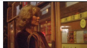
Fig. 2. Dee Wallace spies a lycanthropic happy face in The Howling .

Sayles' and Dante's method of sophistication was to add humor to the mix, and The Howling is funny; surely its title refers not only to lycanthropic baying but to the sense of "howler" as in "very funny joke." The film's happy-face motif (in which one of the ubiquitous, yellow, smiling-face stickers of the 1970s indicates the presence of werewolves; Fig. 2 ) is a perfect condensation of its generic stance – and it is no coincidence that one of these stickers shows up in Gremlins , also as an indication of a horrific transformation (fig. 3).