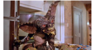
Fig. 6. Gremlin revealed, Stage 3. “Yum yum”.