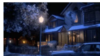
Fig. 10. The defenestration of Mrs. Deagle.