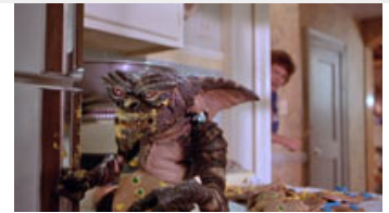
Fig. 5. Gremlin revealed, Stage 2.

At Dorry’s, Gremlins drink heavily, smoke to excess, gamble (and cheat at cards), pick their noses, expose themselves, and beat and kill each other without a second thought. To emphasize the Gremlins’ unpleasant behavior, Dante organizes it into a kind of catalogue: fairly quick cuts from one shot of Gremlin depravity to another. The scene takes place over 4 minutes, 22 seconds, and contains 72 shots, for an average shot length of about 3.6 seconds: fairly quick. (This figure is diminished considerably by a short montage of a Gremlin breakdancing, a moment which highlights Dante’s eagerness to satirize the fickle