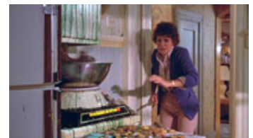
Fig. 8. Kitchen carnage.